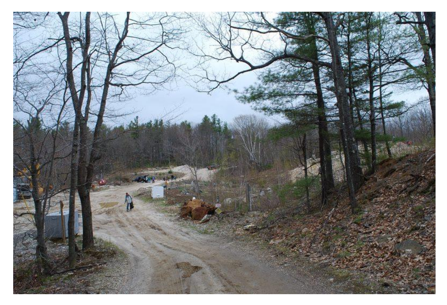
2016 NEMC Field Trip to Mt. Mica